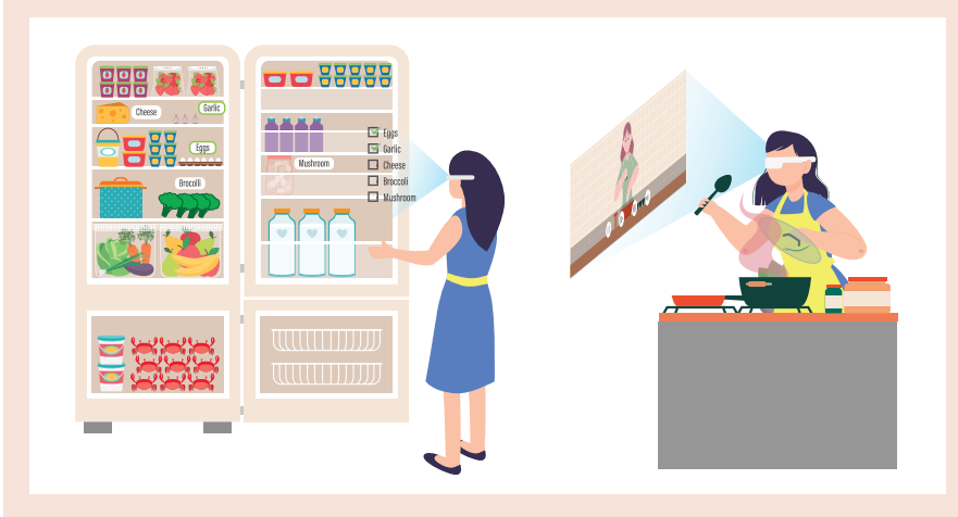
Figure 3. The user is browsing for ingredients in the refrigerator with the help of augmented labels (left). The user cooks the ingredients while simultaneously adjusting the playback of a guided video (right).