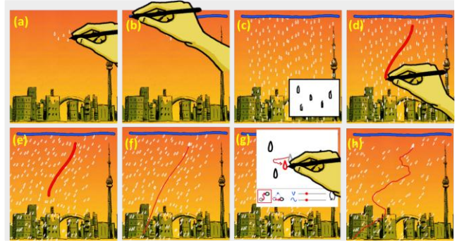
Figure 1. Creating an emitting texture. The user draws the source patch (a), then sketches a line emitter (b), which results in an emitting texture with a default motion (c). The user sketches a motion path (d), which instantaneously changes the global trajectory of the raindrops (e). Finally, she adjusts the granular motion by adding subtle translation to the raindrops (g), supplementing the global motion (f), with local variations (h)

Draco enables the creation of a wide range of intricate animation effects, seemingly bringing illustrations to life. The core component of our system is kinetic textures, a new animation framework, which simultaneously achieves generality, control and ease of use. The interaction techniques within Draco capitalize on the freeform nature of sketching and direct manipulation to seamlessly author and control coordinated motions of collections of objects. Draco pushes the boundary of an emerging form of visual media that lies between static illustration and videos. Our user evaluation points to a variety of applications that would potentially empower end users to author and explore animation effects.